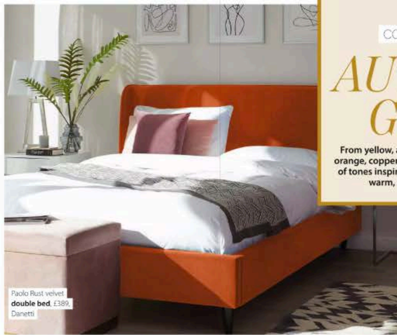
Paolo Rust velvet double bed, £389, Danetti