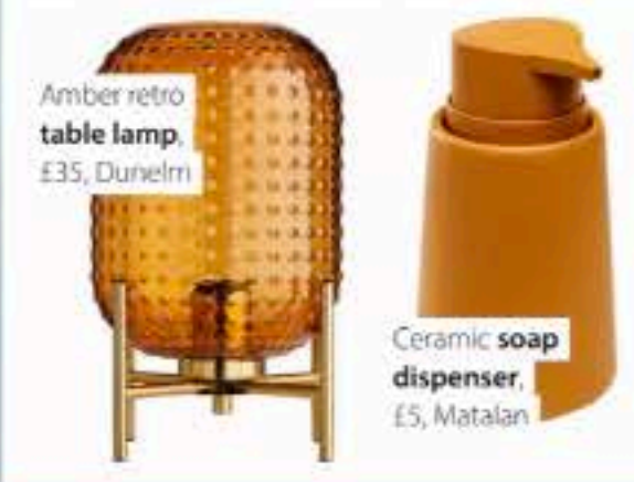
Amber retro table lamp, £35, Dunelm