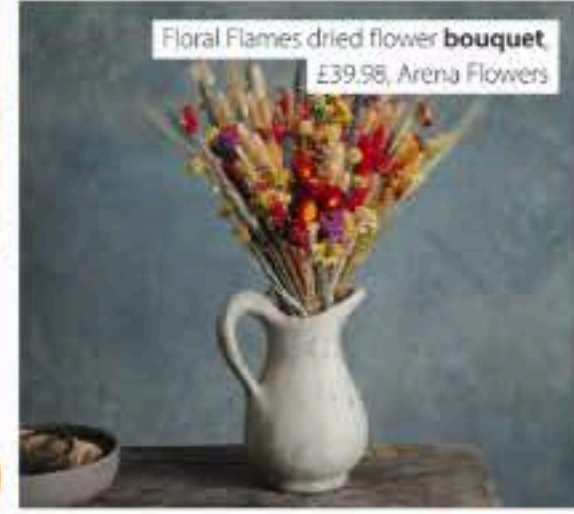
Floral Flames dried flower bouquet, £39.98, Arena Flowers