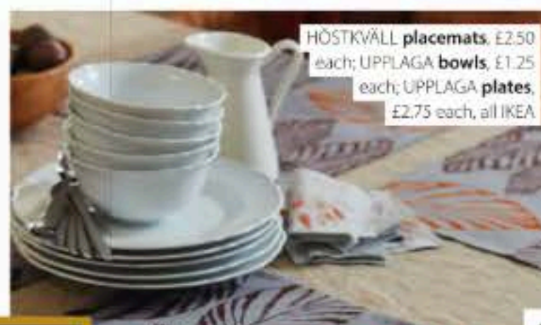
HÖSTKVÄLL placemats, £2.50 each; UPPLAGA bowls, £1.25 each; UPPLAGA plates, £2.75 each, all IKEA