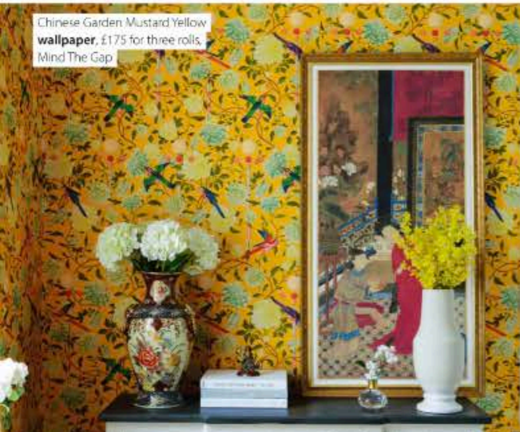
Chinese Garden Mustard Yellow wallpaper, £175 for three rolls, Mind The Gap