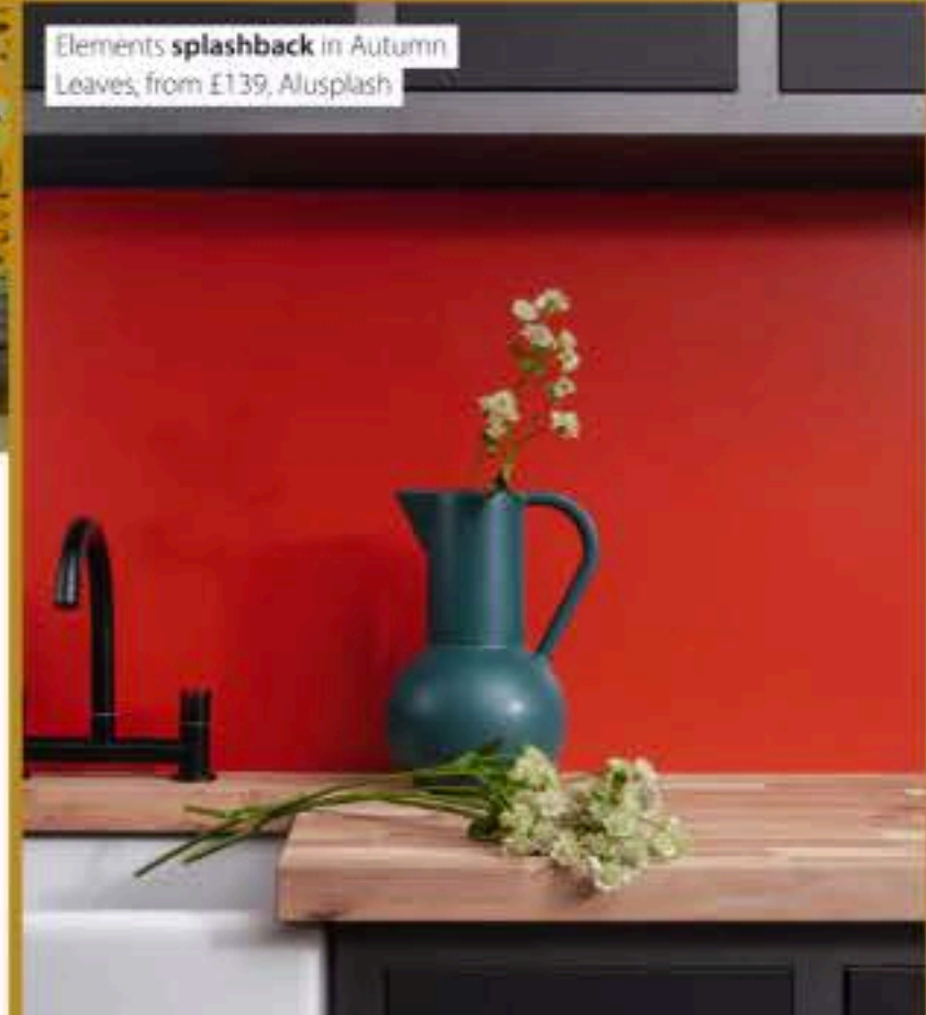
Elements splashback in Autumn Leaves, from £139, Alusplash