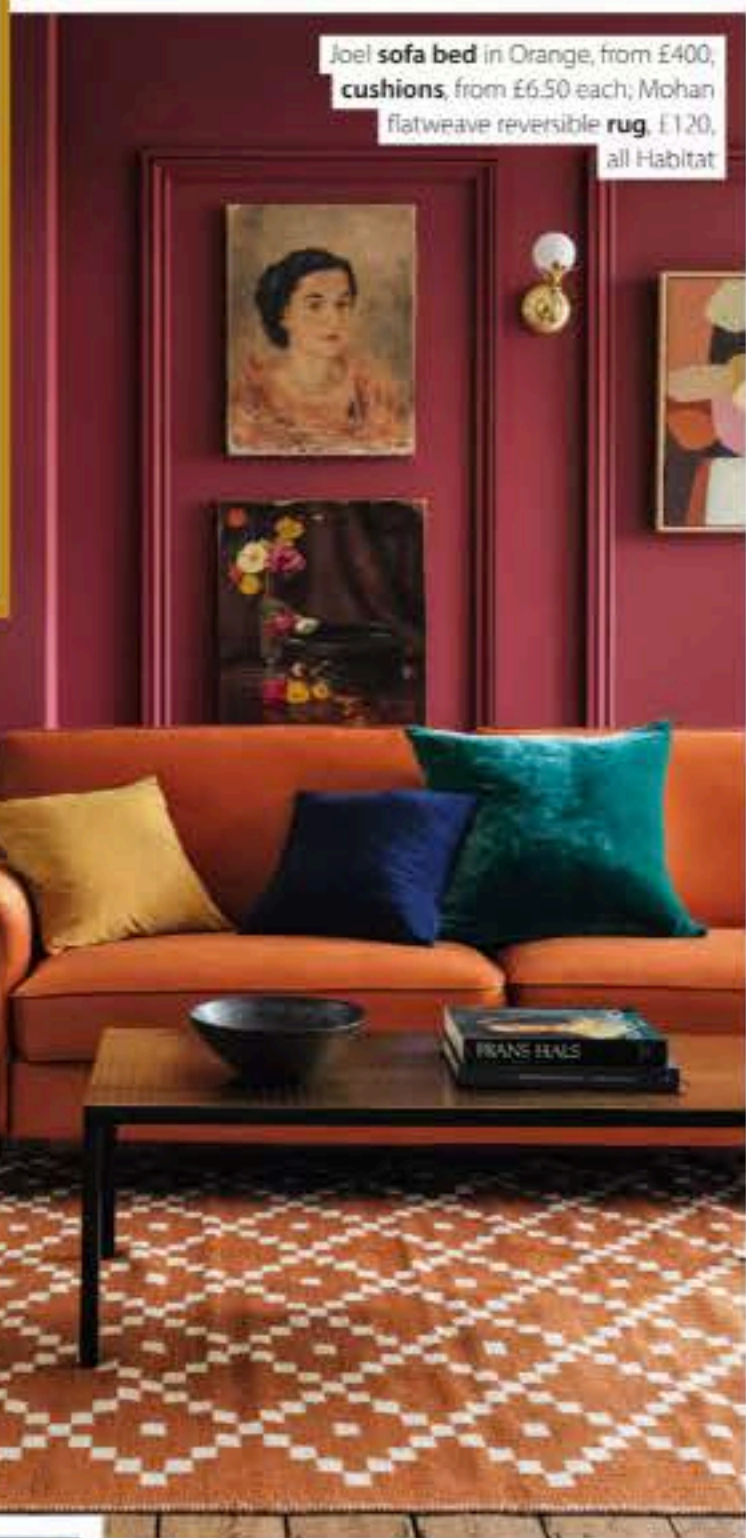
Joel sofa bed in Orange, from £400, cushions, from £6.50 each; Mohan flatweave reversible rug, £120, all Habitat

COLOUR CRUSH AUTUMN GOLD From yellow, amber and mustard to burnt orange, copper and terracotta, a rich harvest of tones inspired by falling leaves creates a warm, welcoming ambience