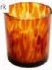
Amber dappled votive, £2.50, Primark