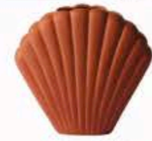
Rust shell vase, £24.99, Coffee & Cloth Ltd