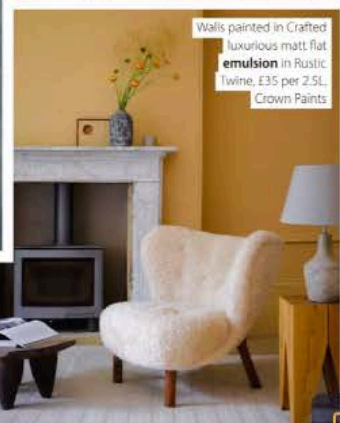
Walls painted in Crafted luxurious matt flat emulsion in Rustic Twine, £35 per 2.5L, Crown Paints